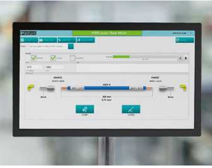
The software tool controls the devices and guides the user both clearly and intuitively through the process of wire preparation with subsequent wiring.