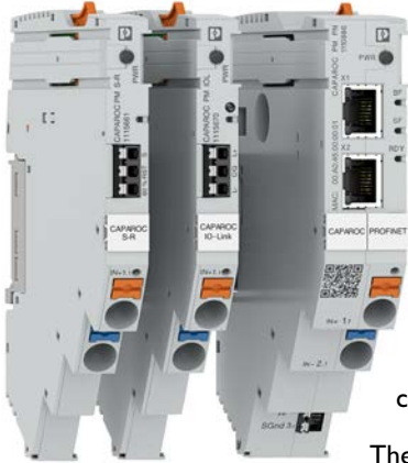
Figure 2: CAPAROC is a customizable electronic circuit breaker system. It uses data-driven power modules to customize overcurrent protection.

The CAPAROC circuit breaker system from Phoenix Contact easily exceeded the requirements for the distributed power the automation architecture demanded. CAPAROC uses data-driven power modules to customize overcurrent protection. With numerous feed-in power modules, circuit breakers, potential distribution modules, and current rails, CAPAROC makes it easy to design an intelligent system with communication.