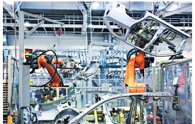
Figure 1: More complex products and processes mean manufacturers need to add more sensors, actuators, cameras, and other devices.

Over the years, the metal products that the customer produces have become more complex, driven by lighter materials, new alloys, and state-of-the-art bonding technologies. The manufacturer needed to add more sensors, actuators, cameras, and other field devices to ensure traceability and provide the quality desired from the production equipment.