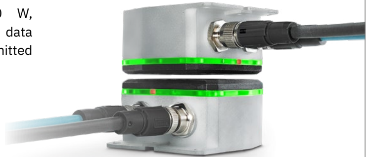
NearFi couplers for contactless power and data transmission