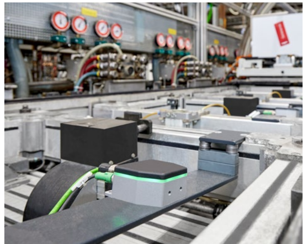
A NearFi coupler for contactless data transmission is installed on each workpiece carrier

The Viessmann Group has been producing heating technology products as well as air conditioning and cooling systems for more than a hundred years. Automated testing of the end products requires workpiece carriers that transport the manufactured condensing boilers through the test stands. A physical connection for the Profinet-based transmission of sensor data in moving applications is prone to interference. This is why Viessmann uses the NearFi contactless real time Ethernet solution from Phoenix Contact for wear-free and maintenance-free communication.