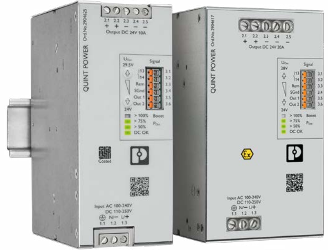
Figure 2: Integrated redundancy: the QUINT Power Plus version offers great potential for space and cost savings in the system with integrated decoupling MOSFET.

Unlike other standard power supplies with an integrated decoupling function, QUINT Power is the only one to provide preventive function monitoring. Individually adjustable signaling thresholds for the output current detect and indicate asymmetrical load distributions or overloads in the event of a fault. This enables the user to swiftly restore redundancy. In the process industry, the control and signaling of faults play an important role in achieving consistently high system availability. ■