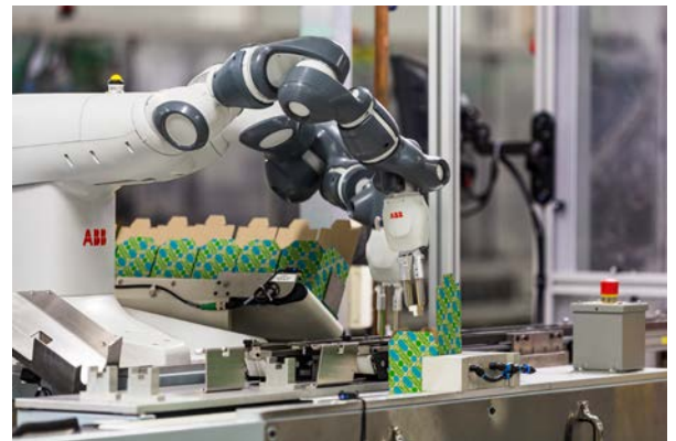
Figure 1: The cobot places a terminal block into a package.

In 2005, Phoenix Contact established a development and manufacturing company at its U.S. headquarters near Harrisburg, Pennsylvania. The D&M company brings production closer to customers in North and South America. Phoenix Contact brings a unique perspective to Industrial Internet of Things (IIoT) applications. Not only does Phoenix Contact develop and manufacture products that make the IIoT possible, but the company actively uses these technologies to improve its own operations and sustainability initiatives.