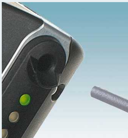
Simply insert the conductor, ...