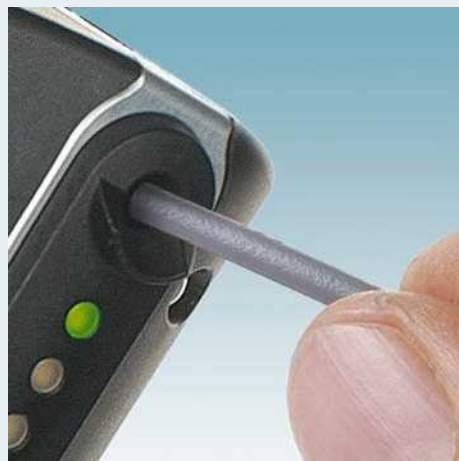
... stripping and crimping is carried out automatically ...