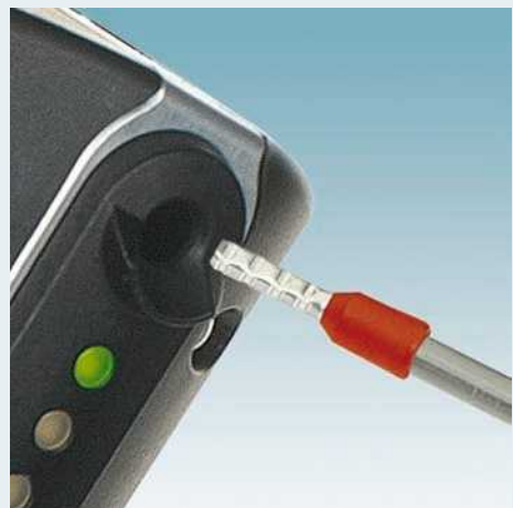
...and you're done!