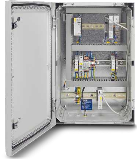
Weather station for the continuous recording of all weather data

The weather station from Phoenix Contact keeps you informed at all times regarding the efficiency of your photovoltaic system. Thanks to our extensive portfolio of sensors, we provide you with weather stations tailored to your needs. The preconfigured sensors are immediately available to transmit weather data.