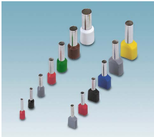
Figure 1: In many cases, the designer can select ferrule color based on preference, but generally, blue ferrules are used for 14 AWG, black for 16 AWG, and red for 18 AWG.

Ferrules come in many sizes and colors. The size required for the application depends on the AWG of the wire. The color used can be the user's choice unless specified in the panel build design; typically, however, blue is used for 14 AWG, black for 16 AWG, and red for 18 AWG. Special sized collars on insulated ferrules are available to accommodate thicker insulated wires, where the colored collar, or insulation, has a larger diameter. (Figure 1)