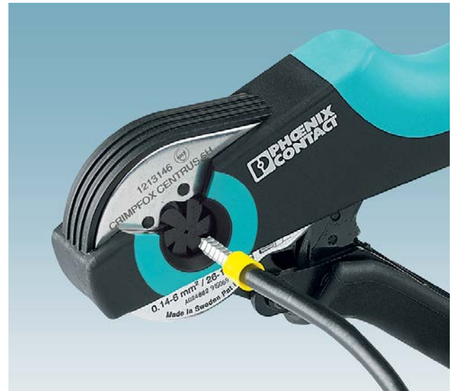
Figure 3: For UL Listing to apply, ferrules must be used with the approved crimper from the same manufacturer.

There is often confusion about Underwriters Laboratory (UL) Listing and approval as it relates to ferrules. The simplest explanation is this: Ferrules are not UL Listed. The UL Listing applies to the combination of ferrule plus crimper. UL tests a manufacturer's ferrules with the same manufacturer's crimpers, and either passes or fails them. If passed, the combination is then UL Listed. Because of the testing requirements and process, mixing manufacturers is not permitted. Ferrules from Manufacturer A cannot be crimped by Manufacturer B's crimpers, regardless of whether both manufacturers carry UL. (Figure 3)