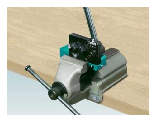
Quick to secure

The PPS COMPACT profile cutter can be clamped in a vise quickly and easily.