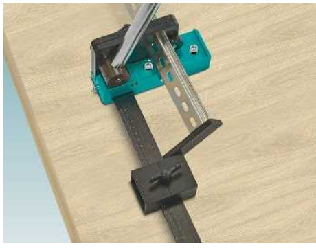
Dimensionally accurate measuring

Using a tape measure, the individual DIN rail lengths can be quickly and easily set, without taking up space.