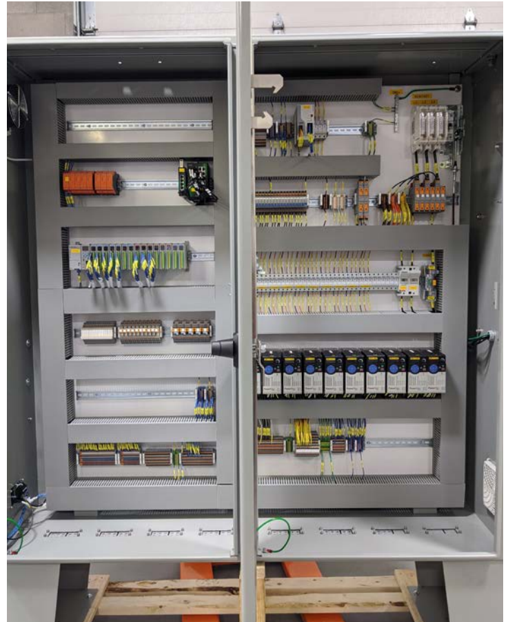
Figure 4: Novum condensed the control system into just two standing cabinets, compared with three or four in the original system.

“What I like about Phoenix Contact is I can trust their product line. I do not have to bring it in for testing from a quality standpoint first. I don’t have to be concerned that it’s going to break down in an unexpected way two years into it or even during the commissioning,” he concluded. “If I go with Phoenix Contact, it lessens the load on my shoulders, makes me sleep better at night, and I just know that the product that they’re giving me is going to do what it says it’s going to do.”