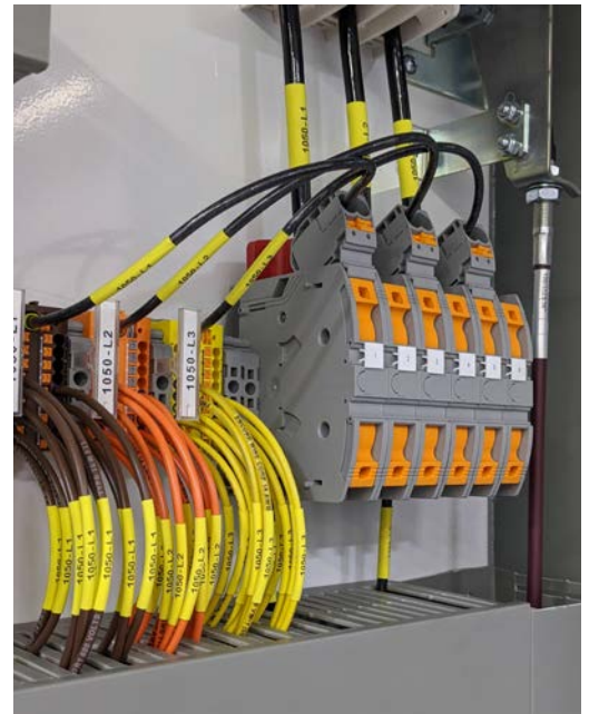
Figure 2: PTPOWER offers fast, user-friendly connection for wiring large conductors. Novum now uses PTPOWER for nearly all of its power distribution.

Novum fully overhauled all four control systems within the short four-month development timeline. The new system’s footprint