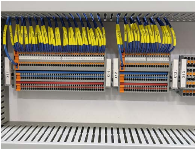
Figure 3: Despite their small width, the PTIO terminal block range saves time and space when wiring. The easy Push-in connection makes them fast, easy, and reliable.

encompassed just two standing control enclosures, compared with three or four in the old system.