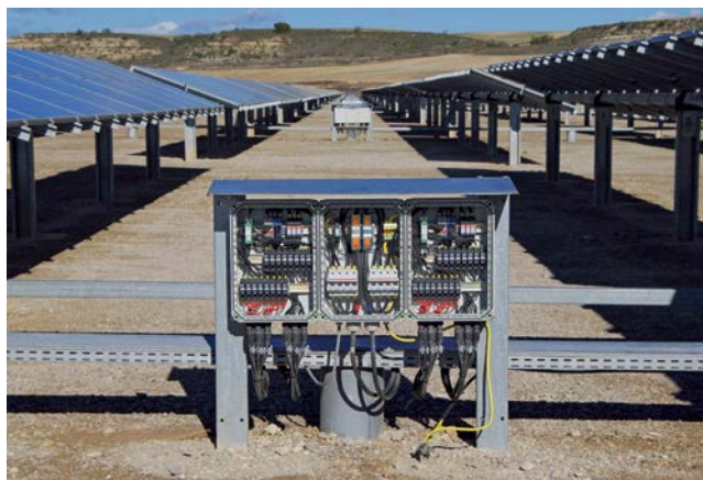
Figure 2: With solar parks being built all over the world, the connection technology must be particularly easy and safe – PT Power can be seen in the center connection box (upper middle).