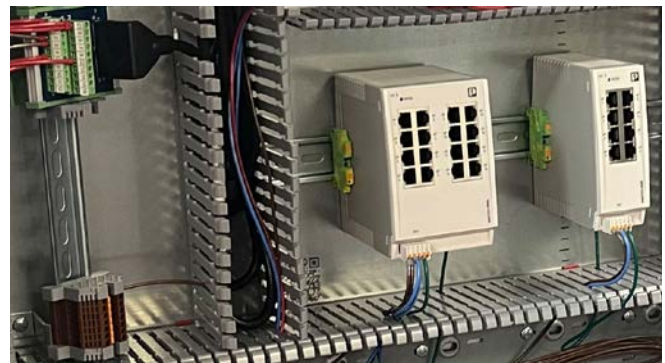
Figure 3: The FL 2000 Ethernet managed switches were more cost-competitive and improved the network reliability.