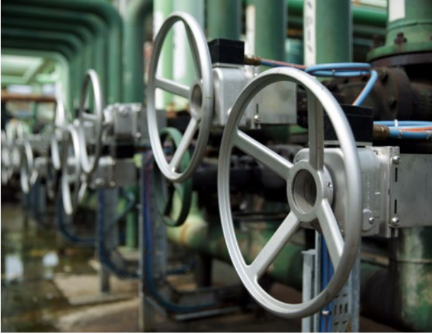
To ensure that system faults can be detected at an early stage, valve operation will still be manual in the future

The operator wants valve operation to still be manual in the future so that employees retain an understanding of the overall process. The regular presence of employees on site also means that any necessary repairs to valves, screw connections, and other equipment can be identified at an early stage and carried out immediately.