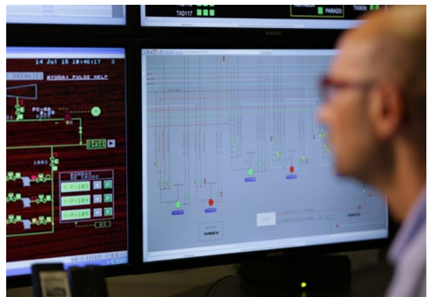
The routes for material transport can be configured, controlled, and monitored in the control room

The control room now has continuous access to data on valve positions, line pressure levels, and pumping stations. This allows material transport through the pipeline networks to be monitored centrally and liquids and gases to be transported from one of the defined sources to the specified destination. The costly contamination of various products can therefore be safely avoided. In addition, the workload of field operators is significantly reduced because the routes for material transport can be configured, controlled, and monitored.