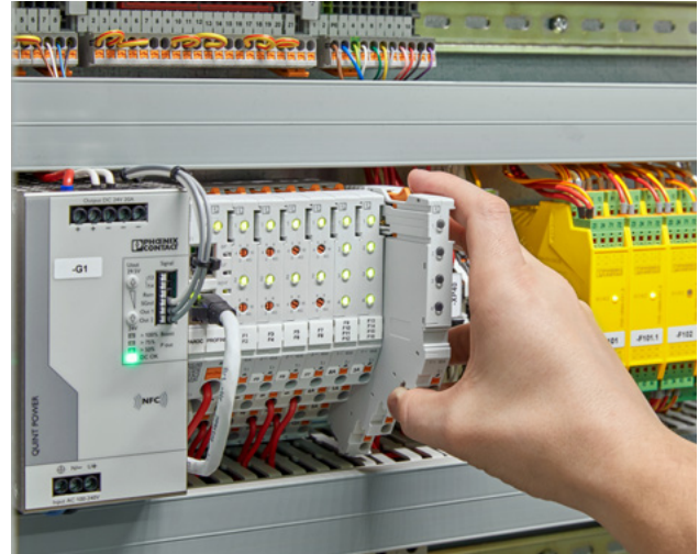
Intuitive operation, simple maintenance, fast troubleshooting: The easy nominal current setting and clear identification of connections and potentials increase security and comfort.

With its versatile combination options and easy design-in and operation, CAPAROC creates a tailored system to meet any application's circuit protection needs.