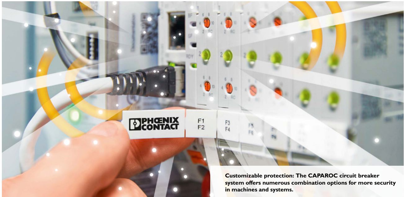
Customizable protection: The CAPAROC circuit breaker system offers numerous combination options for more security in machines and systems.