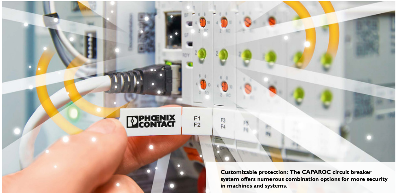
Customizable protection: The CAPAROC circuit breaker system offers numerous combination options for more security in machines and systems.