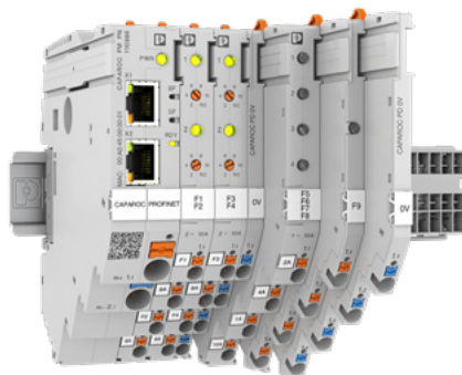
Customized modular system for surge protection: with many combination options, intuitive operation, and simple design-in, CAPAROC marks a new standard in device protection.

Today, 24 V DC power systems in control cabinets have more requirements than ever before. Many systems feature high-quality power supplies, redundancy modules, and UPS modules, along with electronic circuit breakers and remote monitoring mechanisms, to ensure high system availability. At the same time, it is getting more complex to plan, combine and procure suitable components, and set up supply systems. Individual components, such as circuit breakers, can help reduce system complexity.