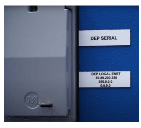
Figure 3: NSRW uses the NEO to print different types of labels, making it easy to identify terminal blocks, IP addresses, device functionality, and more.

"With Phoenix Contact, we can just load the blank material into the printer, and it prints it out beautifully," said Chris. "It comes out so neat, and it's so repeatable. We use it for printing the labels for the terminal blocks. We've also got labels to identify